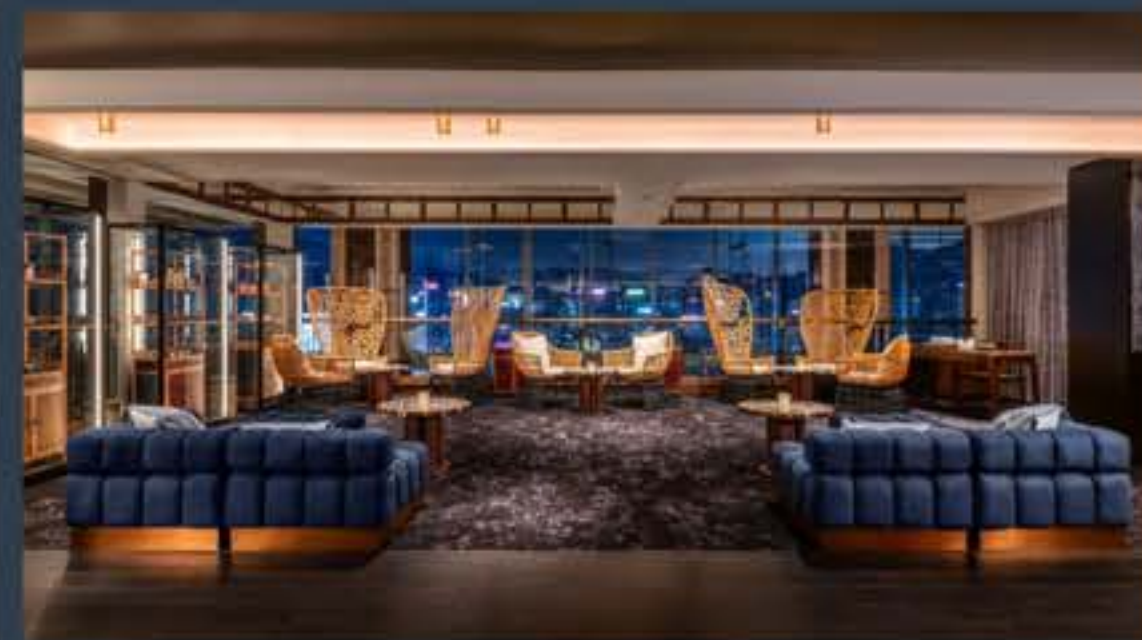
The Tea Lounge