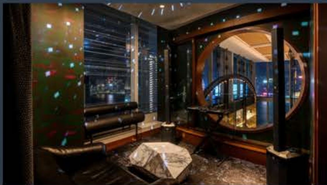
Mister DeeJay Lounge